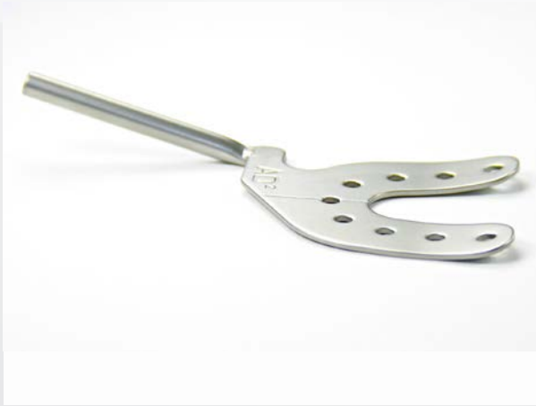
FB400029 Curved Bite Fork

If you have patients where the lower 2 molars are extruded or where the upper 2 molars are not present, try out our Curved Bite Fork. In these instances, the curved bite fork better captures posterior registration marks and is more comfortable for the patient. Like all of our bite forks, it's constructed of steel and ready for plenty of use.