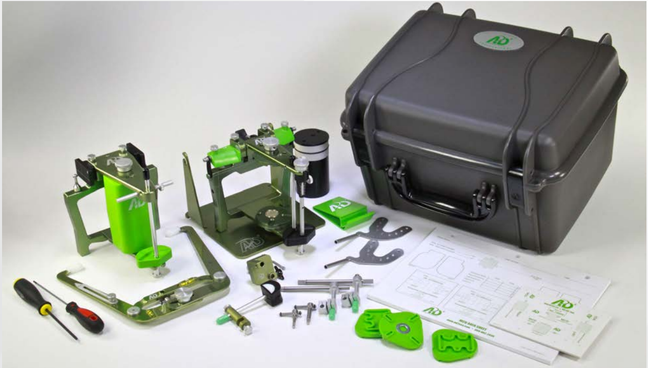
AR100007 AD2 Magnetic Professional System with AR100011 Articulator

While buying equipment individually allows you to custom tailor your needs, AD2 also offers preconfigured systems using our most popular products. Not only does this simplify the ordering process for you, but it also saves you 10-15% in cost versus buying individually.