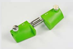
AR330005 0.5mm Analogs