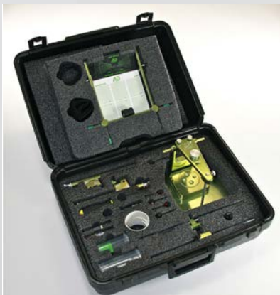
Hinge Axis Recorder with Travel Case

The adjustable side arms and recording frame are designed to be lightweight for maximum patient comfort and use single screw adjustments for all anterior-posterior and side-to-side positioning. These components use hand polished aluminum with high gloss anodized finishes. And just to be sure we give you the ultimate in smooth, we Teflon impregnate all parts.