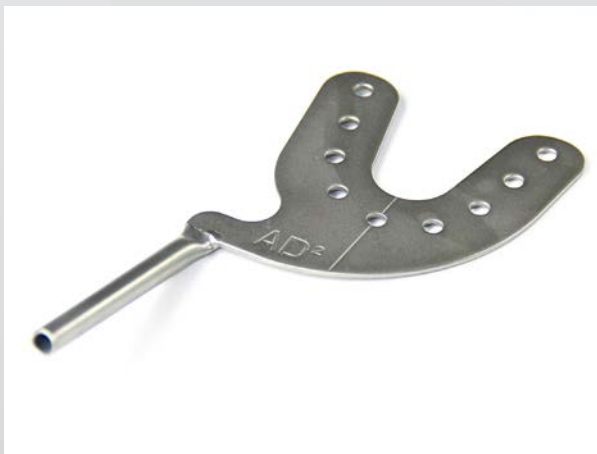
FB400028 Flat Bite Fork

If you work on more than one patient at a time with your facebow, you'll want to purchase a few extra bite fork assemblies. This assembly includes a flat bite fork (FB400028) and a stem assembly (FB400030).