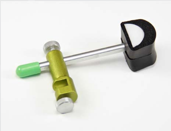
FB400015 Nasion Relator Assembly

The AD2 Anatomic Facebow is a complete system including the facebow, mounting table, nasion relator, two bite fork assemblies with toggle screws and an allen head screwdriver. With integrated bubble levels and polished aluminum construction, our facebow was designed for both doctor and patient comfort.