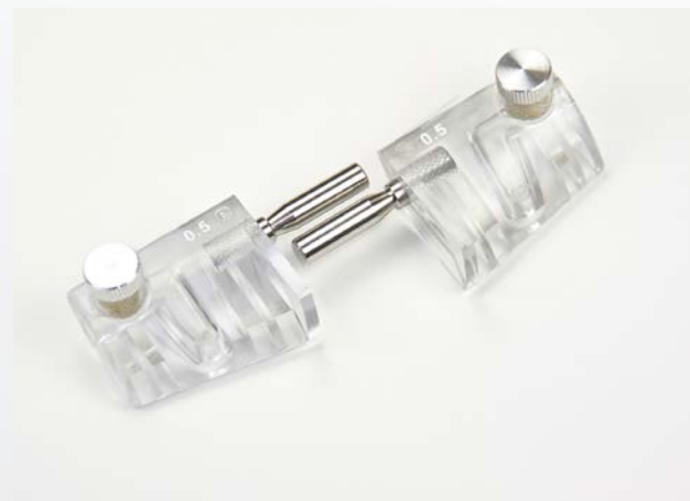
AR330008 0.5mm Clear Analog

If you're in a teaching environment, check out our 0.5mm Clear Analog. What better illustrates your points than having students observe the condyle move through the fossa box? Let your students experience their "Aha" moment with this great instructional analog.