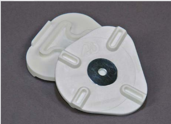
MP280065 AD2/Panadent Compatible Magnetic Mounting Plates (sold in bags of 50)

With our magnetic mounting system, AD2 provides dental professionals everything they need to work efficiently and accurately. Just attach our green anodized magnetic bases once, and you're ready to mount cases in seconds. The system includes two aluminum magnetic bases, 30 mounting plates, allen screws, wrench and Teflon AD2 EZ cushions (fully compatible with Panadent).