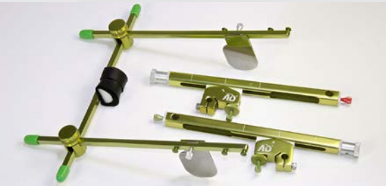
Adjustable Side Arms and Recording Frame

The AD2 Hinge Axis Recorder Deluxe System is exactly what you'd expect from us - a comprehensive system with everything you need for professional results. The system includes our HA750000 Hinge Axis Recorder as well as the AR330000 Complete Analog System. When your system arrives, you'll enjoy the best of AD2 quality including adjustable side arms, spring loaded lead holders, discluders, mounting stand, analogs with side shifts ranging from 0.5mm - 2.5mm and even multiple plaster retention rings for mounting models.