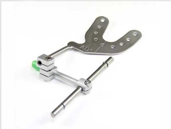
FB400129 Curved Bite Fork Assembly

If you have patients where the lower 2 molars are extruded or where the upper 2 molars are not present, try out our Curved Bite Fork. In these instances, the curved bite fork better captures posterior registration marks and is more comfortable for the patient. Like all of our bite forks, it's constructed of steel and ready for plenty of use.