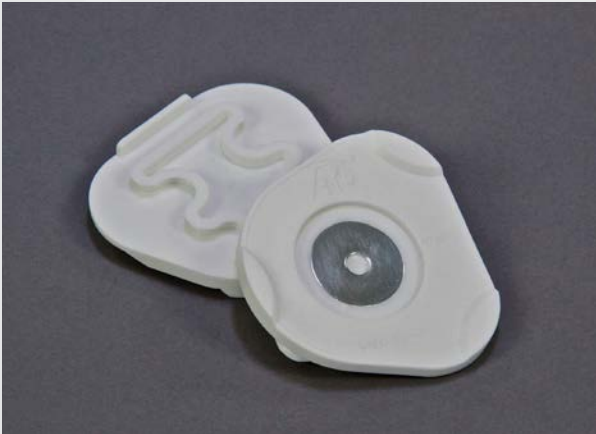
MP292065 Artex Compatible Magnetic Mounting Plates (sold in bags of 50)

The AD2 Stratos-compatible, magnetic plate fits perfectly on the Adesso base using the same arch shaped plate you've come to expect from us. No longer are you stuck with a strange circular magnetic plate trying to figure out which side faces forward. Save money, time and confusion with these plates.