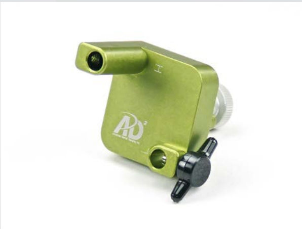
FB400023 Mounting Table Assembly

We all know with work and travel, things sometimes get lost or misplaced. If you find yourself missing your nasion relator, it's not a problem with AD2. We can ship a replacement nasion relator assembly to you overnight if needed.