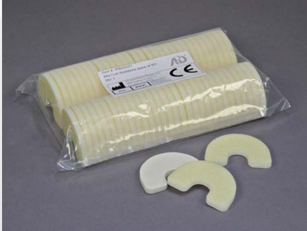
TP400027 Bite Fork Stabilizers (pack of 60)

Our Bite Fork Stabilizers are composed of a white foam material with self-adhesive on one side for affixing to a bite fork. These stabilizers are an easy alternative to bite registration material or cotton rolls and allow the lower teeth to support the bite fork against the upper teeth.