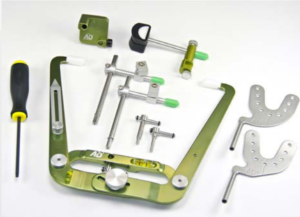
FB400000 Anatomic Facebow

The AD2 Anatomic Facebow is a complete system including the facebow, mounting table, nasion relator, two bite fork assemblies with toggle screws and an allen head screwdriver. With integrated bubble levels and polished aluminum construction, our facebow was designed for both doctor and patient comfort.