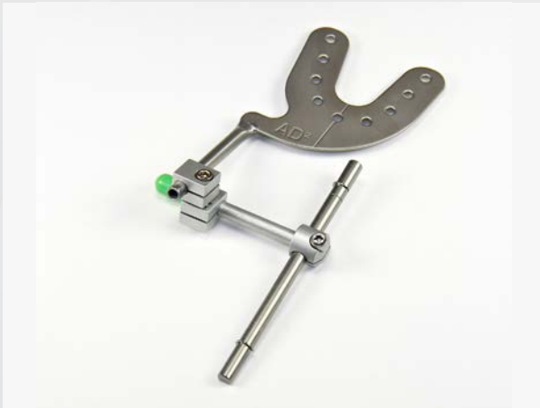
FB400027 Flat Bite Fork Assembly

AD2 Accu-Bites utilize the same wax compound you're accustomed to for capturing bite registration on a bite fork. The individual, self-adhesive Accu-Bites can be easily applied and removed for use in the busiest office environment.