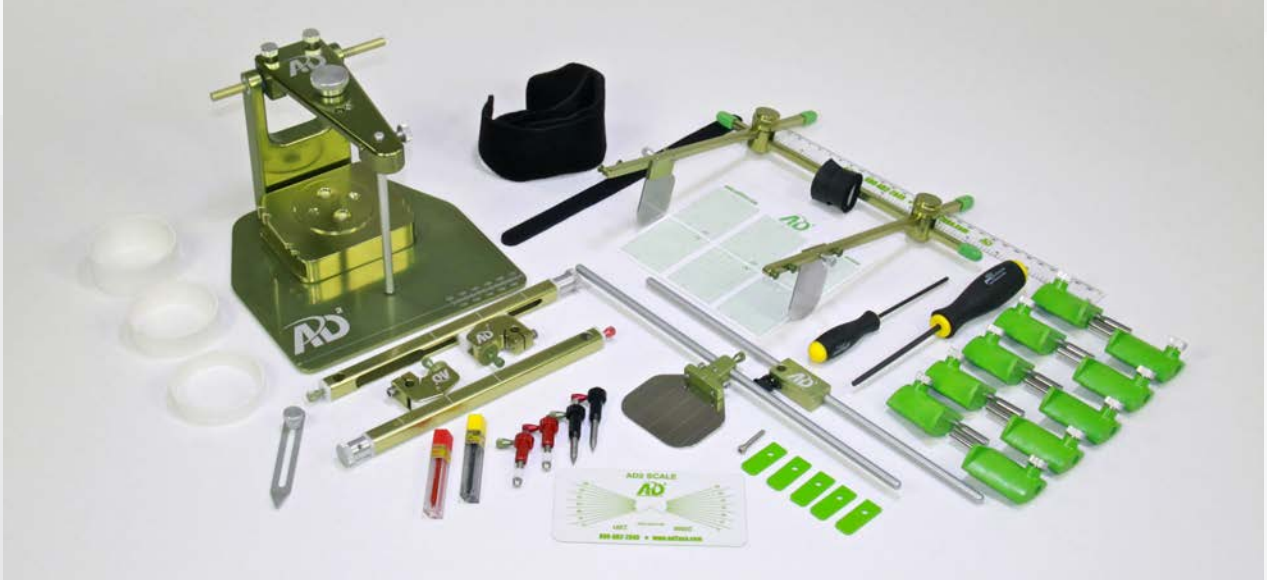
HA760000 Hinge Axis Recorder

The AD2 Hinge Axis Recorder Deluxe System is exactly what you'd expect from us - a comprehensive system with everything you need for professional results. The system includes our HA750000 Hinge Axis Recorder as well as the AR330000 Complete Analog System. When your system arrives, you'll enjoy the best of AD2 quality including adjustable side arms, spring loaded lead holders, discluders, mounting stand, analogs with side shifts ranging from 0.5mm - 2.5mm and even multiple plaster retention rings for mounting models.