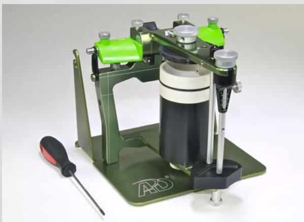
AR100011 Articulator with Straight Incisal Pin Module, Mounting Stand and Test Column