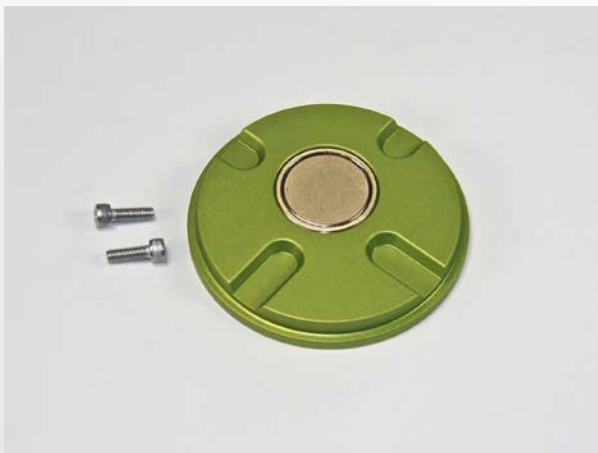
MP280010 Magnetic Mounting Base Assembly

If you already have our magnetic mounting plates at your lab or office, you may only need to order the AD2 Magnetic Mounting Base Assembly. This includes the base, magnet, allen head screws and EZ cushion washer.