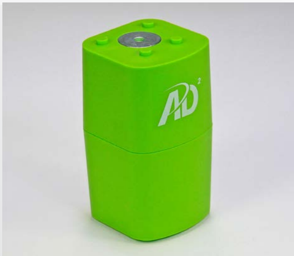
MC170070 Magnetic Support Column

If you've made the move to magnetic mounting, go all the way with our magnetic support column for the MCD. Precision molded in green plastic, this column will firmly hold your upper and lower MCD frames together when not in use.