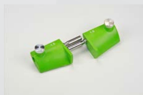
AR330015 1.5mm Analogs