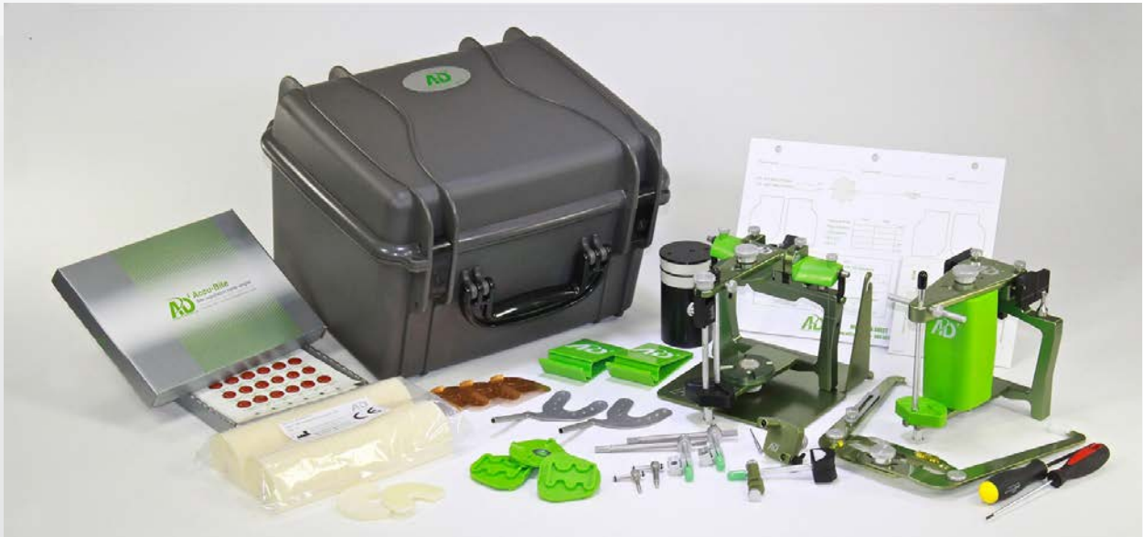
AR110051 Bioesthetic Basic Magnetic System

AR110050 Bioesthetic Basic System, uses non-magnetic mounting (not shown)