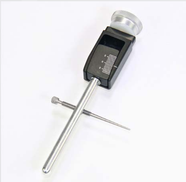
AR140050 Curved Incisal Pin Module

When you need measurements in millimeters, try the AD2 Straight Incisal Pin Module for your new articulator. The module slides easily into the upper frame and tightens down with a simple twist of your hand. We've even included an incisal position pin, which is threaded for precisely setting the incisor position when doing diagnostic set-ups.