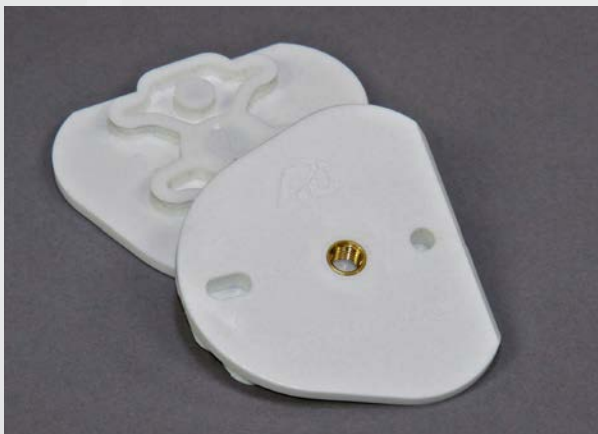
MP270065 AD2/Panadent/Whip Mix/SAM Screw Mounting Plates (sold in bags of 50)

If you already have our magnetic mounting plates at your lab or office, you may only need to order the AD2 Magnetic Mounting Base Assembly. This includes the base, magnet, allen head screws and EZ cushion washer.