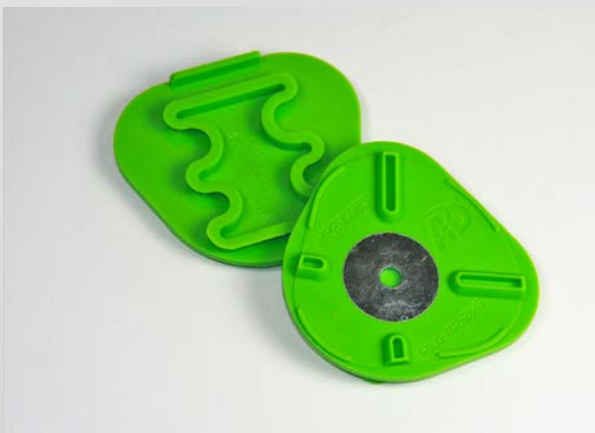
MP290065 Whip Mix/Hanau/Denar Compatible Magnetic Mounting Plates (sold in bags of 50) (soon available in white)

Already using our magnetic mounting system and need some extra mounting plates? These plastic mounting plates are ready to go in bags of 50 plates for your convenience and are fully compatible with Panadent's Magna-Split™ magnetic bases (not for use with PAL™ Plastic Articulator Lite).