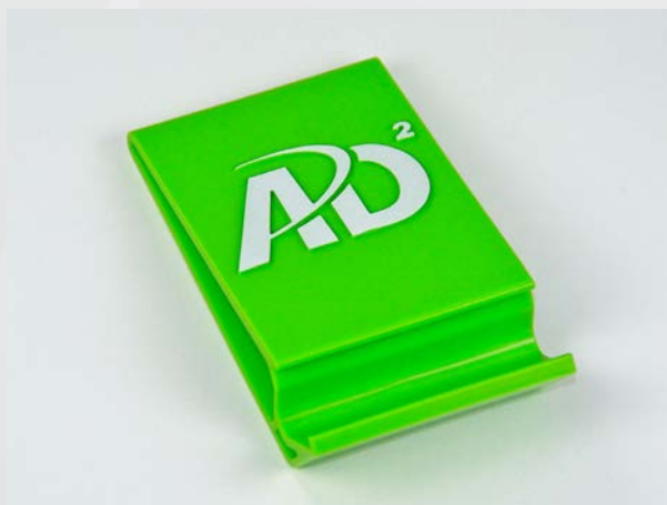
AR300000 Support Leg

Want to be sure your work is 100% accurate? With our Test Column, you can create a calibration split cast for your articulator and MCD. With just some dental stone and separating medium, you'll be ready quickly to have a permanent calibration testing cast for use at any time in the future.