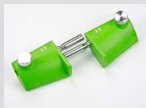
AR330025 2.5mm Analogs

If you're in a teaching environment, check out our 0.5mm Clear Analog. What better illustrates your points than having students observe the condyle move through the fossa box? Let your students experience their "Aha" moment with this great instructional analog.