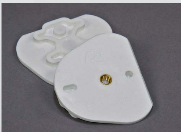
MP270165 Denar/Hanau (twin pin) Compatible Screw Mounting Plates (sold in bags of 50)

If you prefer screwing your mounted cases down tight, then you'll love these plates. Sold in bags of 50, these plastic plates use self-lubricating threaded brass inserts so your models will always mount smoothly. Compatible with AD2, Panadent, Whip Mix and SAM articulators.