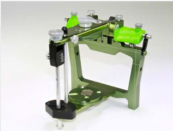
AR100022 (shown with optional MP280000 magnetic mounting system)