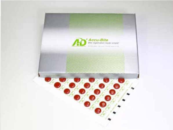
AB310020 Accu-Bite (box of 180)

AD2 Accu-Bites utilize the same wax compound you're accustomed to for capturing bite registration on a bite fork. The individual, self-adhesive Accu-Bites can be easily applied and removed for use in the busiest office environment.