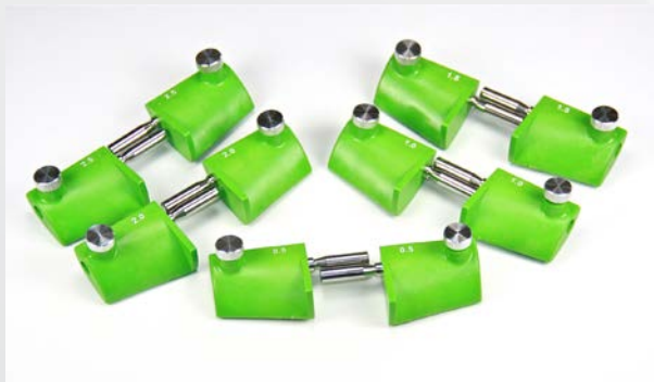
AR330000 Analog Kit

Different patients mean different side shift patterns. We've got you covered though with our family of precision molded analogs ranging from 0.5 mm all the way to 2.5 mm (sold in pairs). If you're looking to save some money, purchase the AR330000, which includes all 5 pairs of analog sizes for one low price (up to 20% less expensive than buying individually).