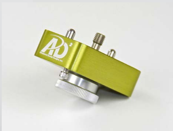
AR240079 Mandibular Mounting Plate Spacer

Ready to get a new perspective on your work? With the AD2 Support Leg, you can safely lean your articulator and MCD back at a 45° angle. The leg snaps on easily, looks stylish and still leaves the side frame of the articulator or MCD open for your hand to grab and lift with.