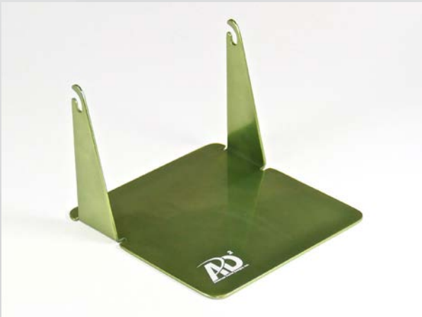
AR100080 Mounting Stand

The AD2 Curved Incisal Pin Module is calibrated using a relational measurement starting from the incisal edge. The tip of the pin remaining in the same vertical dimension on the incisal table when the articulator is opened and closed. Just like the Straight Pin Module, our Curved Incisal Pin Module comes complete with the handy incisal position pin.