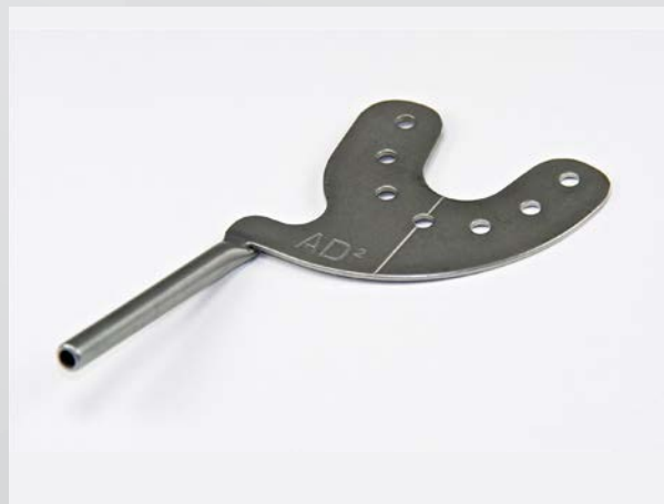
FB400038 Pedo Bite Fork

If you need a bite fork assembly on standby for patients with extruded lower 2 molars or missing upper 2 molars, you'll want to pick up a Curved Bite Fork Assembly. This assembly includes a curved bite fork (FB400029) and a stem assembly (FB400030).