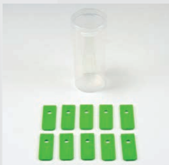
HA770010 Discluser 10 pack

When you need more adhesive graphs for your Hinge Axis Recorder, you'll be back to work quickly with our graph pad. One pad provides 30 crack-and-peel graphs, enough for 15 patients (left and right sides).