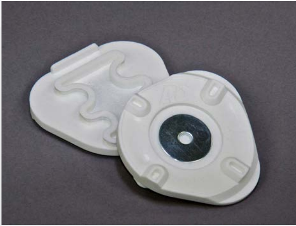
MP291065 Stratos Compatible Magnetic Mounting Plates (sold in bags of 50)

The AD2 Stratos-compatible, magnetic plate fits perfectly on the Adesso base using the same arch shaped plate you've come to expect from us. No longer are you stuck with a strange circular magnetic plate trying to figure out which side faces forward. Save money, time and confusion with these plates.