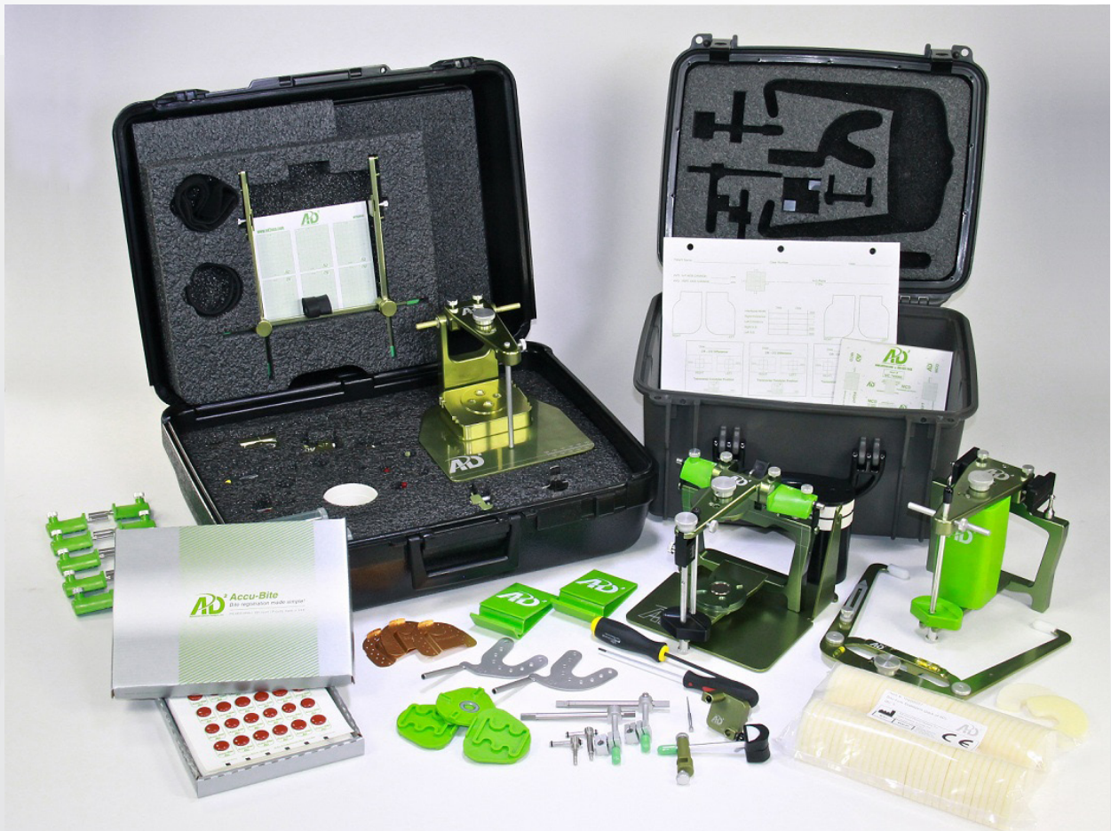
AR110061 Bioesthetic Magnetic Professional System

AR110060 Bioesthetic Professional System, uses non-magnetic mounting (not shown)