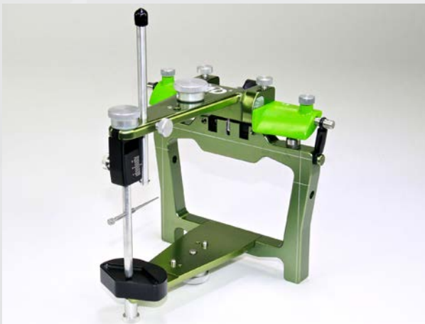
AR100022 Articulator with Curved Incisal Pin Module