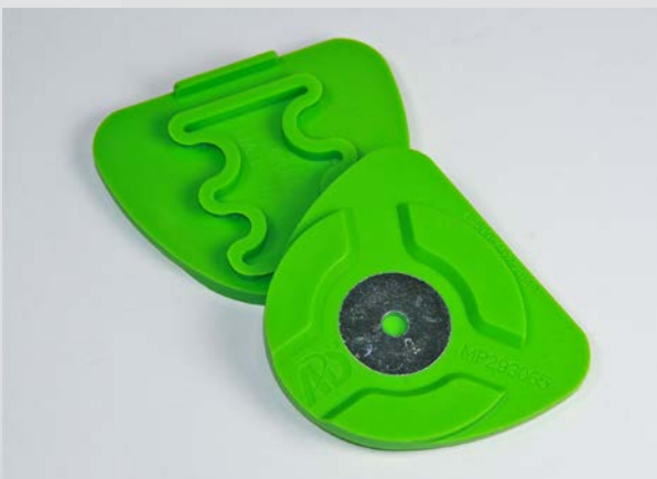
MP293065 SAM Compatible Magnetic Mounting Plates (sold in bags of 50) (soon available in white)

Our Artex® compatible magnetic mounting plates are simple to use and hold your models tightly on the Splitex magnetic base. Don't fumble anymore with separate plates and metal inserts.....our AD2 plate is a simple, all-in-one solution.