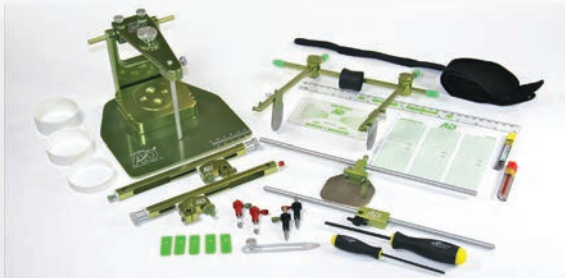
HA750000 Hinge Axis Recorder

Our entry level Hinge Axis Recorder gives you everything you need to record the mandibular pathway quickly and economically. Start with this system to experience the simplicity of the AD2 system and add in the AR330000 analog system when you're ready.