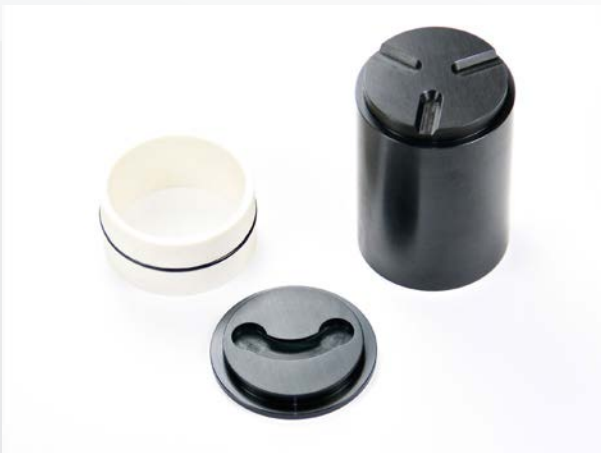
AR100090 Test Column

Want to be sure your work is 100% accurate? With our Test Column, you can create a calibration split cast for your articulator and MCD. With just some dental stone and separating medium, you'll be ready quickly to have a permanent calibration testing cast for use at any time in the future.