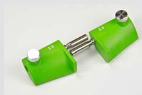
AR330020 2.0mm Analogs