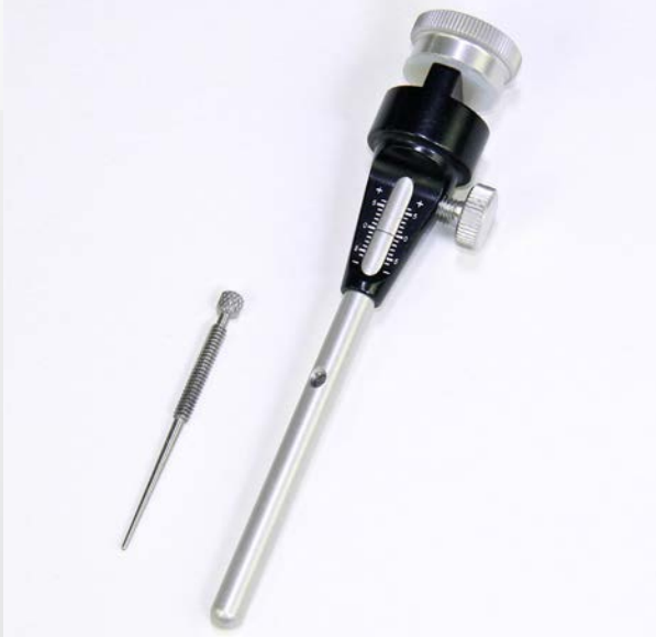
AR140000 Straight Incisal Pin Module

When you need measurements in millimeters, try the AD2 Straight Incisal Pin Module for your new articulator. The module slides easily into the upper frame and tightens down with a simple twist of your hand. We've even included an incisal position pin, which is threaded for precisely setting the incisor position when doing diagnostic set-ups.