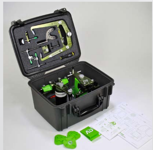
PK900010 Travel Case for Professional System