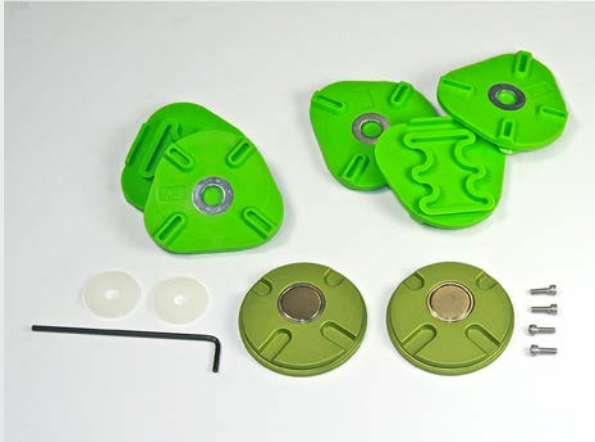
MP280000 Magnetic Mounting System

At AD2, we're all about precision and affordability, which is why we've spent plenty of engineering time developing mounting systems and plates for most major articulator brands. Even if you haven't purchased one of our articulators yet, you can still enjoy savings up to 70% off of most mounting plates with our AD2 plates.