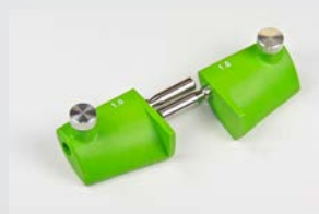
AR330010 1.0mm Analogs