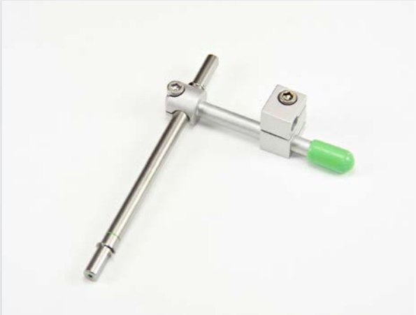
FB400030 Bite Fork Stem Assembly

Our Bite Fork Stabilizers are composed of a white foam material with self-adhesive on one side for affixing to a bite fork. These stabilizers are an easy alternative to bite registration material or cotton rolls and allow the lower teeth to support the bite fork against the upper teeth.